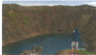
KERID CRATER LAKE