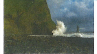
VIK/DYRHÓLAEY AND REYNISFJARA BEACH