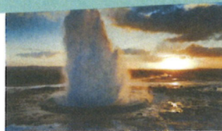
THE GREAT GEYSIR