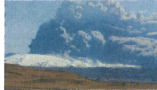
EYJAFJALLA JÖKULL VOLCANO