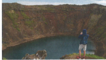
KERID CRATER LAKE