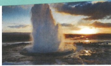
THE GREAT GEYSIR

Volcanoes, glaciers, waterfalls, and more! A trip to Iceland gives you an up-close and personal look at the adventurous side of scientific study. Explore the iconic Blue Lagoon, get inspired by the five forces of nature, and have a blast making unforgettable memories with your friends.