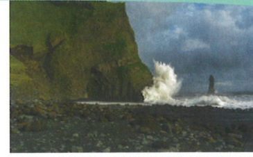
VIK/DYRHOLAÆY AND REYNISFJARA BEACH