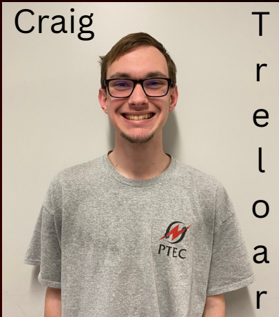
T r e l o r