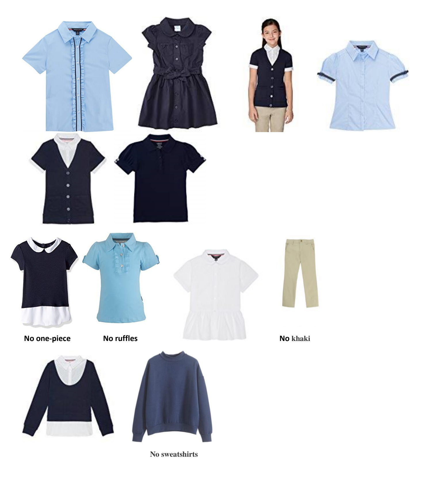
\downarrow\downarrow\downarrow\downarrow NOT ALLOWED: Out of uniform dress code. \downarrow\downarrow\downarrow\downarrow